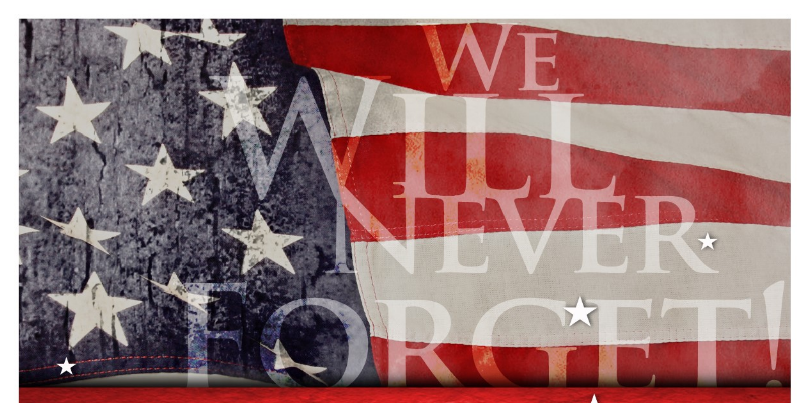
May 2023 Monthly Newsletter for Christ Evangeilcal Lutheran Church